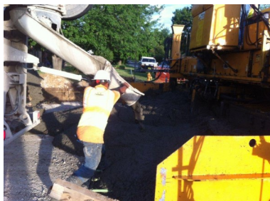
Olivas Construction Concrete Work on Tulsa Highway Project