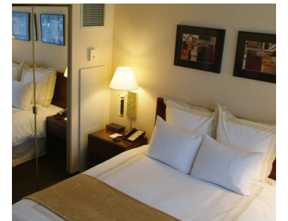
Photos of NCED Conference Center and Hotel Located at 2801 East State Hwy 9, Norman, Oklahoma 73071— site of the 2014 DBE Business Development Conference.