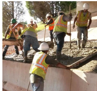
Olivas Construction Concrete Work on Turner Turnpike