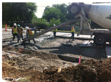
Olivas Construction performing Paving on Yale Street in Tulsa.

WIN. Olivas has grown from a single employee to 25 employees and is now the winner of a contract as a prime with the City of Nichols Hills valued at $122,208.50.