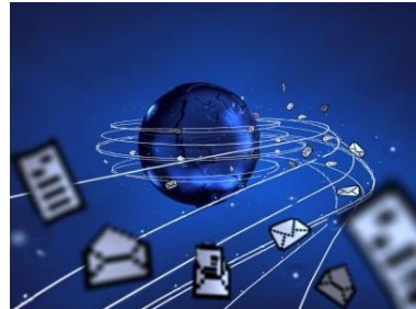
Three Steps to Automation: